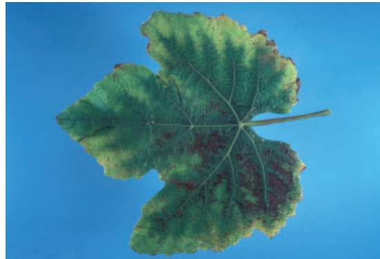
Figure 9.3. Potassium deficiency symptoms.

Potassium deficiency is corrected by applying potash fertilizer. Short-term correction can be made with foliar-applied potassium fertilizer; however, the less-costly and longer-lasting remedy is soil application. Two commonly used potash fertilizers are potassium sulfate and potassium chloride (also called muriate of potash). Potassium chloride is generally much less expensive. Potassium may also be applied as potassium nitrate, but this fertilizer is usually very