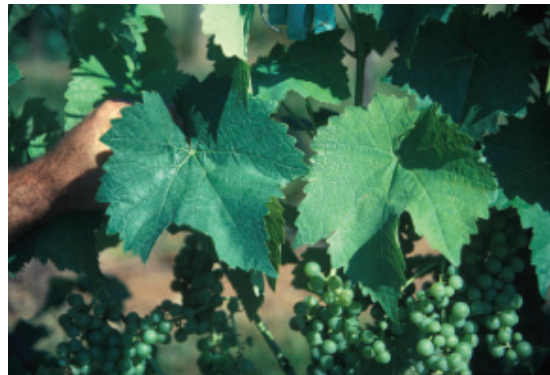
Figure 9.2. Nitrogen deficiency symptoms.

SYMPTOMS AND EFFECTS OF NITROGEN DEFICIENCY. Nitrogen deficiency is not as easily recognized as are deficiencies of certain other elements such as magnesium or potassium. The classic symptom is a uniform light green color of leaves (Figure 9.2), as compared to the dark green of vines that receive adequate nitrogen. Nitrogen deficiency is considered severe if leaves show this uniform light green color. Other clues pointing to nitrogen deficiency are slow shoot growth, short internodal length, and small leaves. Insufficient nitrogen can also reduce crop yield through a reduction in clusters, berries, or berry