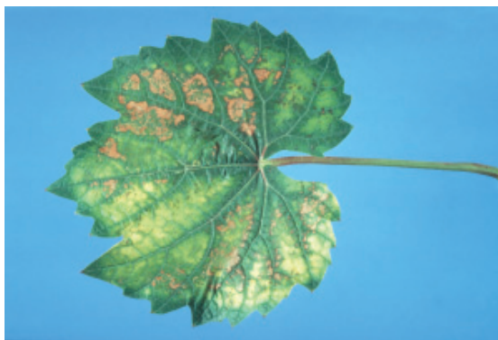
Figure 9.4. Magnesium deficiency symptoms.

SYMPTOMS AND EFFECTS OF MAGNESIUM DEFICIENCY. Deficiency is usually expressed in mid- to late summer when basal (older) leaves develop interveinal (between the veins) chlorosis or yellowing. The nature of the chlorosis depends upon the grape variety, but generally the central portion of the leaf blade loses green color to a greater extent than the leaf margins (Figure 9.4). Tissue near the primary leaf veins remains a darker green. As symptoms progress, the yellow chlorosis can become necrotic and brown. Magnesium deficiency of red-fruited varieties can cause leaves to turn reddish rather than chlorotic. Because magnesium is mobile within the vine, younger leaves are supplied with magnesium at the expense of older leaves. Magnesium symptoms are therefore usually confined to the older leaves except in cases of severe deficiency.