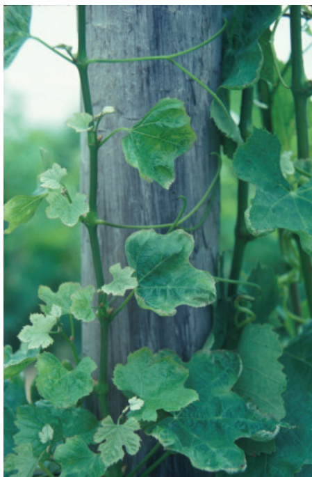
Figure 9.6. A boron toxicity problem.

A soil pH of less than 5.0 or greater than 7.0 reduces the availability of boron. Boron is actually very soluble at low soil pH, but in sandy soils the increased solubility, if coupled with frequent rainfall, can lead to leaching of boron from the root zone. Vines grown on sandy, low-pH soils subjected to frequent rainfall are therefore prime candidates to express boron deficiency symptoms.