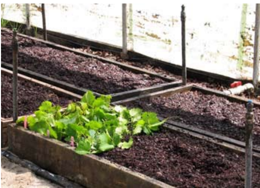
Figure 8. The cutting bed.