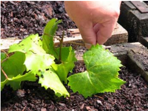
Figure 7. Insert the cutting into propagation mix.